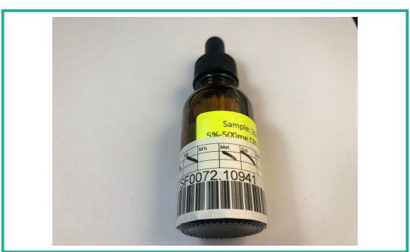
The photo on this report is of a sample collected by the lab and may vary from the final packaging

Test performed via Hardy chromogenic dry and agar plates. ND = Non Detect; LOQ = Limit of Quantitation; Tested Microbial Endpoints: Total Viable Aerobic Bacteria, Total Yeast and Mold, Total Coliforms, Enterobacteriaceae, Aspergillus (flavus, fumigatus, niger and terreus), E.coli pathogenic strains, and Salmonella spp. Microbial testing performed per SOP-000004 Method. LOQ has been set to the Limit of Detection (LOD) / Method Detection Limit (MDL) for all endpoints.